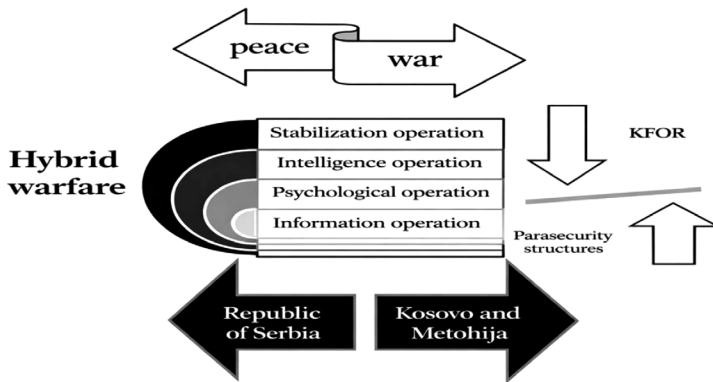
Scheme 1. Hybrid warfare in AP Kosovo and Metohija